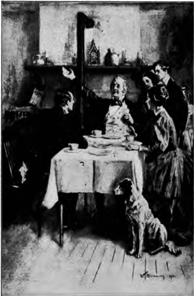
THE COLONEL'S TONGUE WAS A MAGICIAN'S WAND